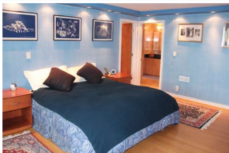
Master Bedroom – The large master bedroom suite includes a custom master bathroom, large walk-in closet, terrace with teak deck facing South, media closet and separate office.