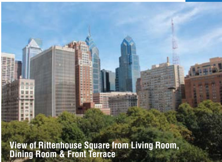
View of Rittenhouse Square from Living Room, Dining Room & Front Terrace