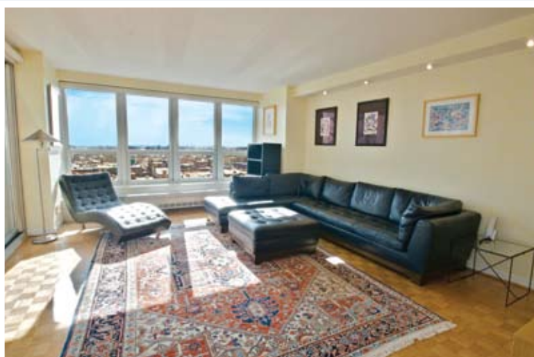
Living Room – The spacious living room offers wrap-around window walls with panoramic views of Rittenhouse Square and the city skyline, as well as a terrace with teak deck.