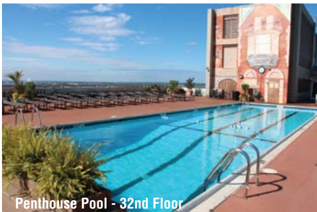
Penthouse Pool - 32nd Floor