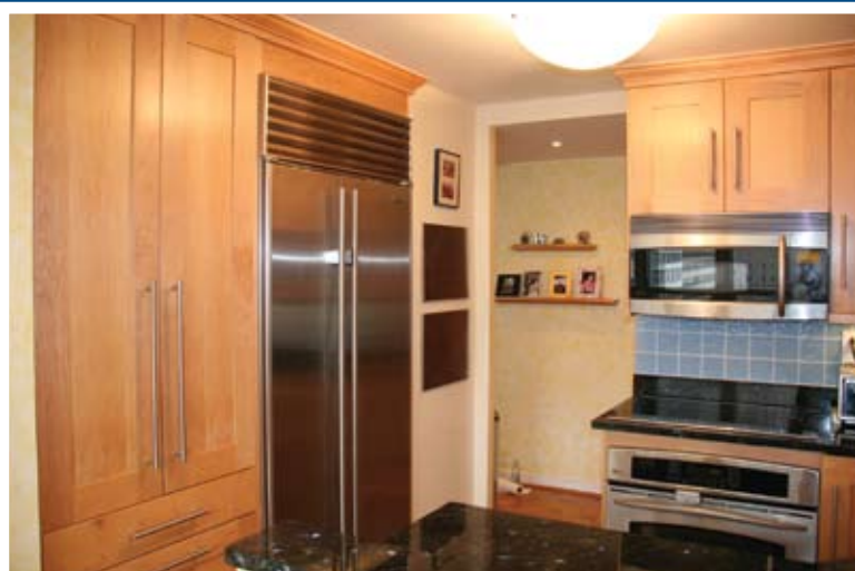
Kitchen – The kitchen features a Sub-Zero refrigerator, GE Profile appliances, ceramic cooktop, granite countertops, Woodmode cabinets, pantry with pull-out drawers, Artemide lighting and glass tile backsplash.