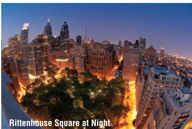
Rittenhouse Square at Night