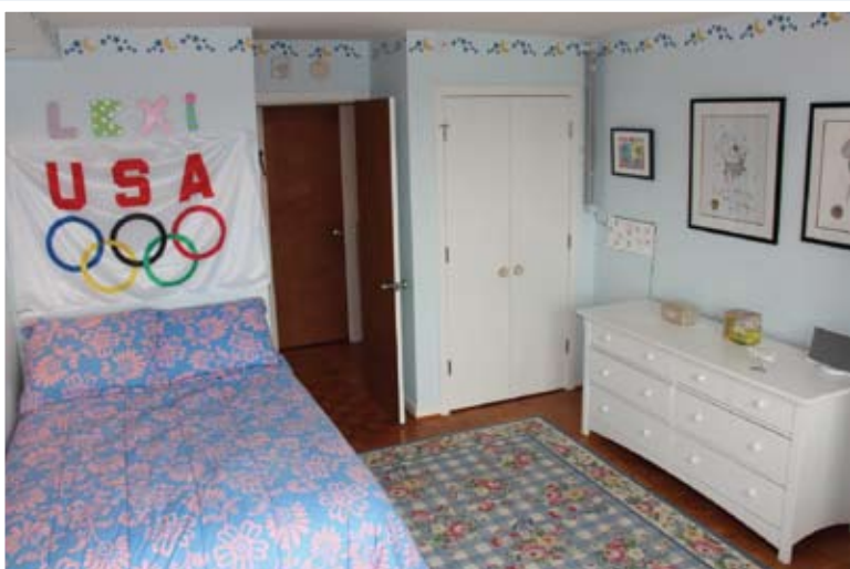
Bedroom 2 – The very spacious 2nd bedroom features large windows, a closet with custom built-ins and overhead lighting.