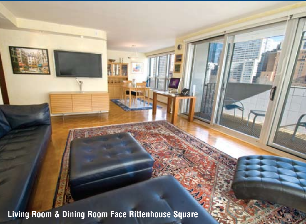
Living Room & Dining Room Face Rittenhouse Square

Spectacular 3 bedroom, 2 bathroom contemporary home with panoramic views of Rittenhouse Square, the City skyline and South Philadelphia; 1,826 square feet of interior space with about 2,000 total square feet including two terraces.