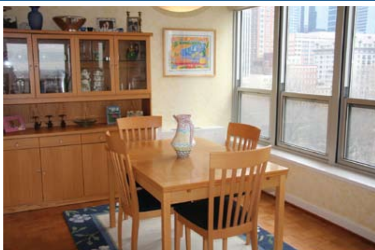
Dining Room – The dining room offers panoramic views of Rittenhouse Square, with plenty of natural daylight and Artemide overhead lighting.