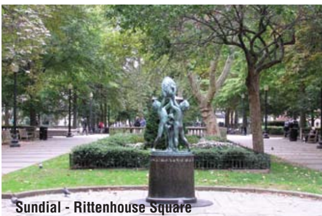
Sundial - Rittenhouse Square

Suite 1006-1007 at The Dorchester is a spectacular 3 bedroom, 2 bathroom contemporary home with panoramic views of Rittenhouse Square, the City skyline and South Philadelphia.