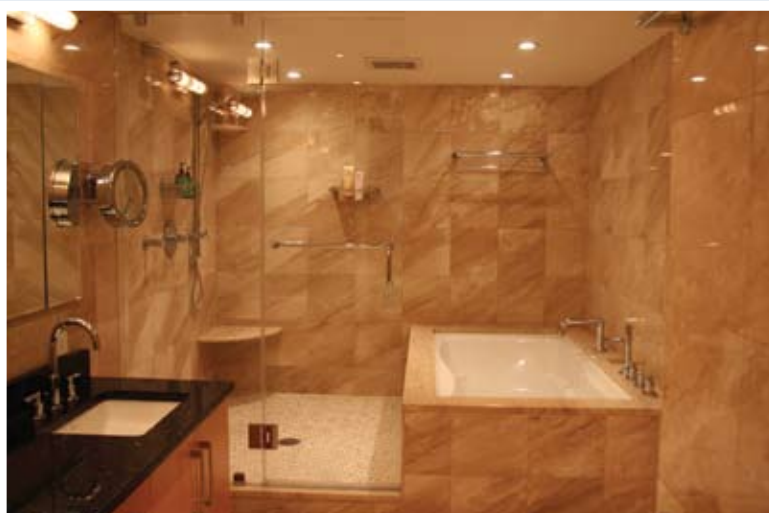
Master Bathroom – The custom master bathroom features floor-to-ceiling marble, double vanity with granite countertop, open-air shower, frameless shower glass, Kohler toilet, Kohler whirlpool, custom cabinetry and separate toilet room.