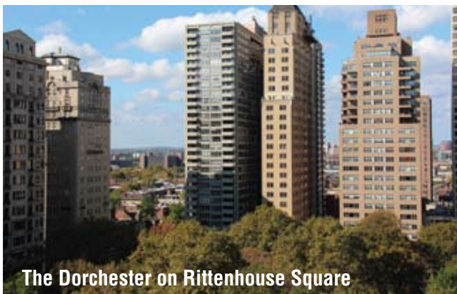
The Dorchester on Rittenhouse Square